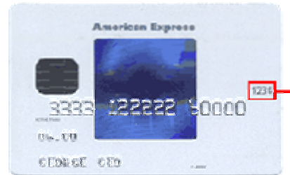
4 Digit Card Verification Number

You can find your four-digit card verification number on the front of your American Express credit card above the credit card number on either the right or the left side of your credit card.